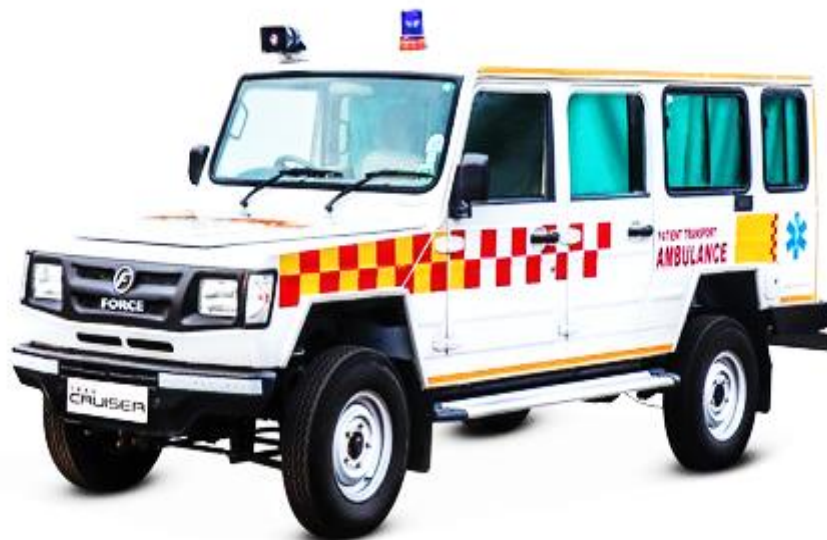
Trax Cruiser ambulance