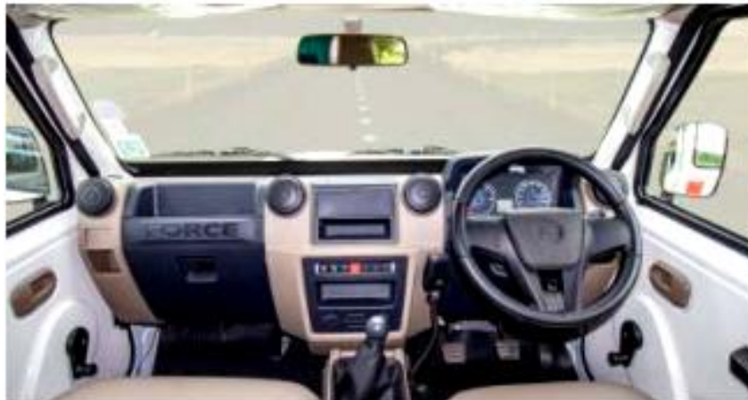
All new interiors, new seats, dual tone dashboard and new instrument cluster