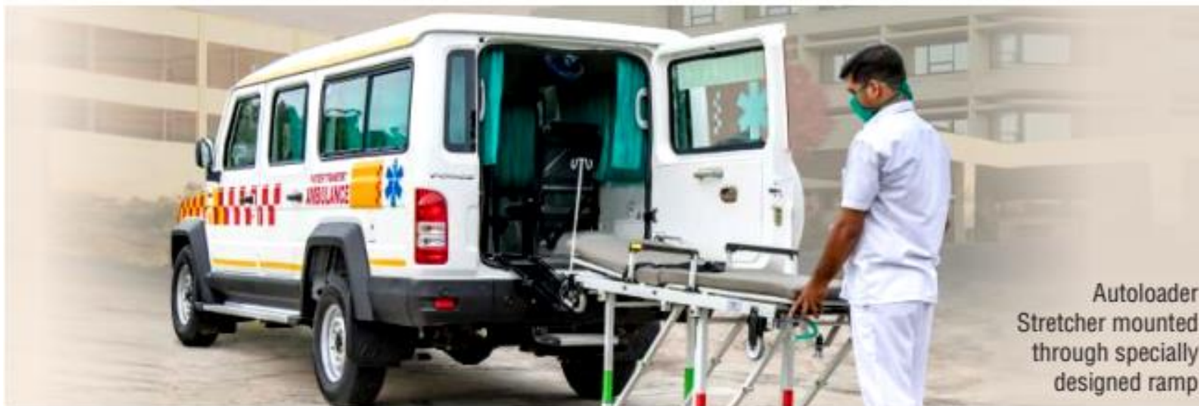
Autoloader Stretcher mounted through specially designed ramp