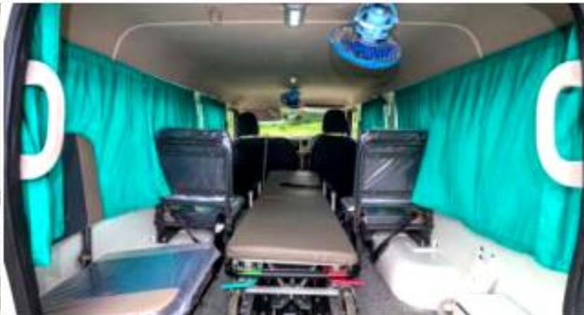
Foldable seats for convenient movement, Swivelling Fans and Ample lighting