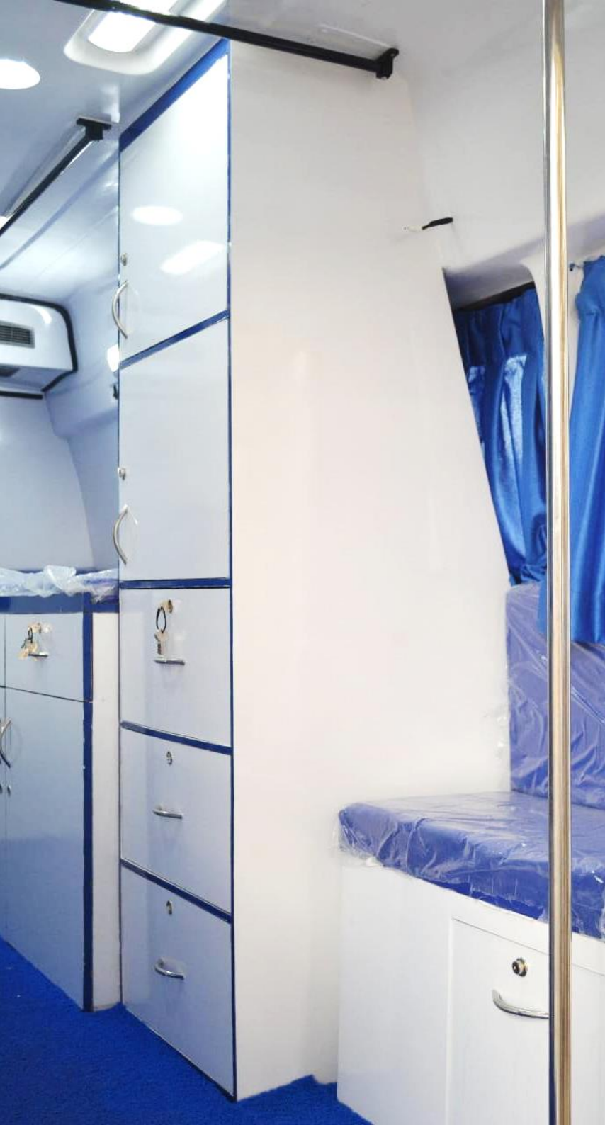
Force Traveller Ambulance Sample Photos