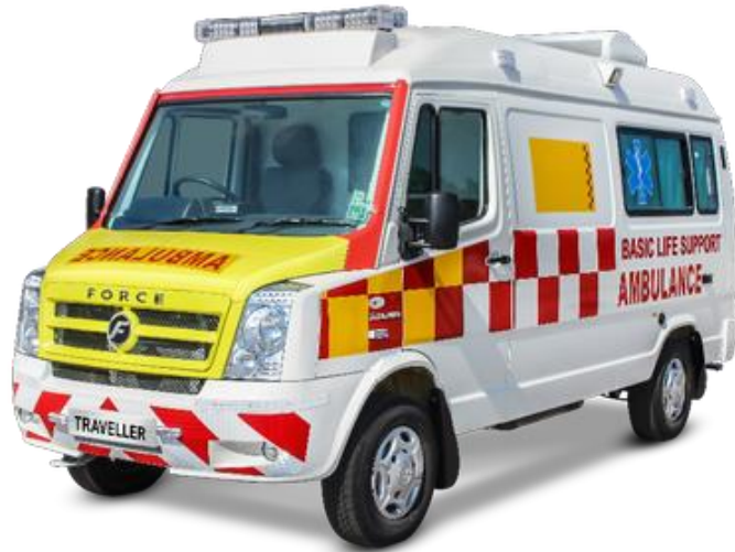
Force Traveller Ambulance